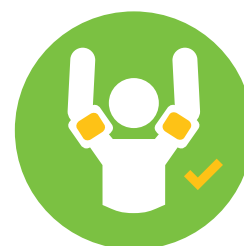
ARMBANDS ARE PERMITTED

A DISCLAIMER MUST BE SIGNED BEFORE THE FOLLOWING CAN BE WORN;