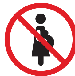
DO NOT RIDE THE FLUMES IF PREGNANT