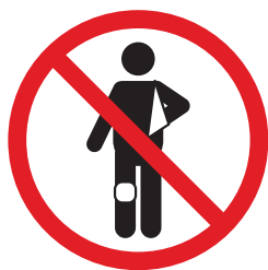
DO NOT RIDE THE FLUMES WITH AN INJURY