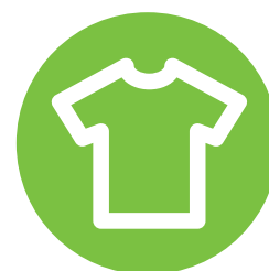
T-SHIRTS ARE PERMITTED