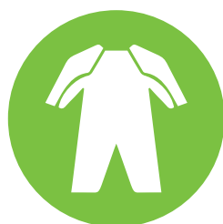
WETSUITS ARE PERMITTED