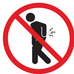
DO NOT RIDE THE FLUMES WITH A BACK PROBLEM