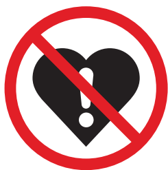
DO NOT RIDE THE FLUMES WITH A HEART PROBLEM