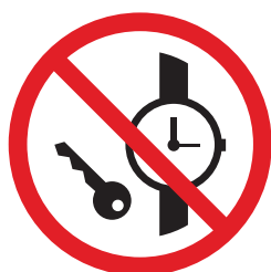
NO WATCHES OR SHARP OBJECTS